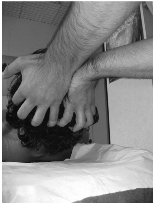
FIG. 6. Treatment of the tentorium cerebelli. Place your fingers in a semicircle. Your little fingers go from the external occipital protuberance to the area above the ears so as to indirectly relax the tentorium cerebelli. This therapeutic approach stops when your fingers perceive that the tissue has softened and when the patient experiences less irritation while leaning his or her head.

symptoms can also occur in areas far from the source of the problem, and work with this manual approach can help achieve a higher success rate. It is hoped that this article contributes to the overall view of the patient and spurred new thinking.