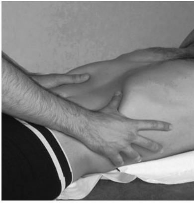
FIG. 3. Treatment of the diaphragm. Place your thumbs and the whole tenar side under the diaphragm, in anterolateral position. The purpose is to search for a tensional balance between the right and left hemcupula, hindering or supporting the different tensions previously observed. Remove hands once an equal, slight tension on both sides can be perceived.

should be used after examination of the aforementioned districts with a general, nonspecific, but nevertheless accurate, attention. Emphasis is given to the techniques of Dr. Upledger, which are simple and easily executable. 49,50 Finally, note that the anatomic features described in books do not always correspond to the subjective anatomic appearance, and the palpation of the operator plays an important role in treatment. 51