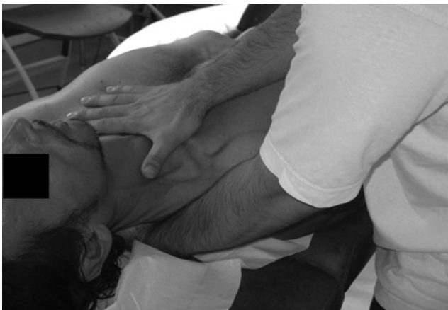
FIG. 4. Treatment of the thoracic outlet. Place one hand, with a delicate touch, on the contact point between the two clavicles, and place the other hand under the back, in parallel position. Apply a slight pressure until your hand perceives a release of the tissues, as if there were no resistance in trying to make your hands meet. This therapeutic approach was first proposed by Dr. J.E. Upledger.

The diaphragm muscle should not be seen as a segment but as part of a body system. To find the correct treatment solutions, one must see the whole and all the links as highlighted in this article. With all these connections, the